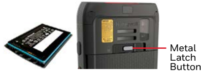
Metal Latch Button

CT40 battery pack, 4020 mAh, for use with CT40 configurations with plastic battery latch button (last two digits in part number begin with 0: CT40-L*N-xxxx0x). Cannot be used on CT45 product family.