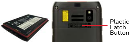
Plastic Latch Button